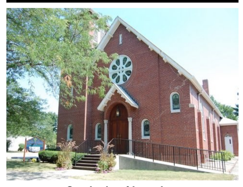
Our Lady of Lourdes Catholic Church